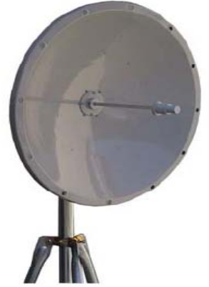
Parabolic dish antenna