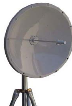
Parabolic dish antenna